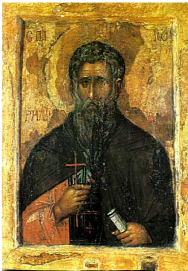
Saint John of Rila (876-946)