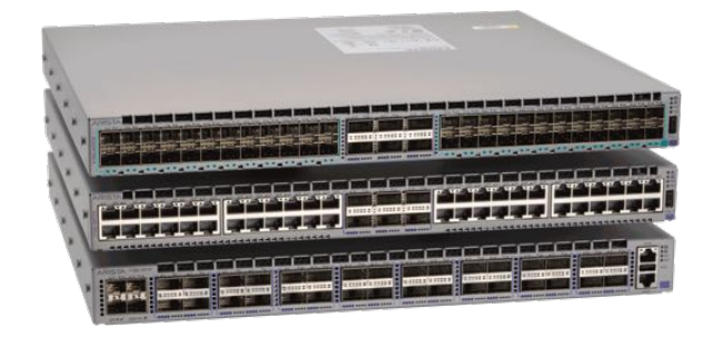
Arista 7160 Series of Data Center Switches

25GbE interfaces with SFP and 100GbE with QSFP on the 7160 Series enables flexible choices of port speed providing unparalleled flexibility and the ability to seamlessly transition data centers to the next generation of Ethernet performance. The 7160 Series provide industry leading power efficiency with airflow choices for back to front, or front to back. Combined with Arista EOS the 7160 Series delivers advanced features for cloud, big data, virtualized and traditional designs.